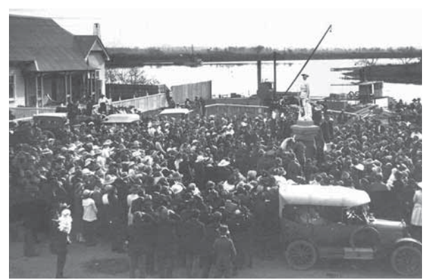
Anzac Day — Gladstone War Memorial.

See Gladstone War Memorial. This memorial to WW1 fallen sons of the Gladstone area was unveiled on 6th August 1920. Each year Anzac Day