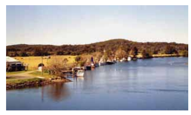
The fishing fleet at Jerseyville.

5. Continue down Wharf St. At the end of the street is the site of the Pelican island store owned by George