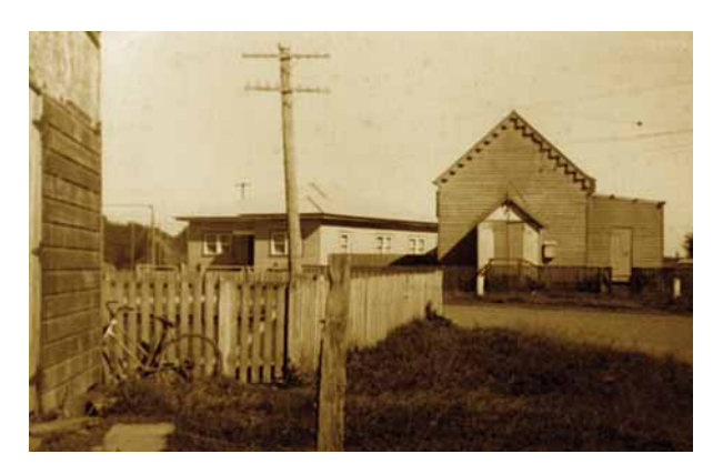
The Good Templar's Hall.

About I km downstream there was another wharf called "Meehan's" which was the main wharf for the village. The first school (called Summer Island school) was further downstream where there are camphor laurel trees in the paddock, and the ferry was where there is now a boat ramp.