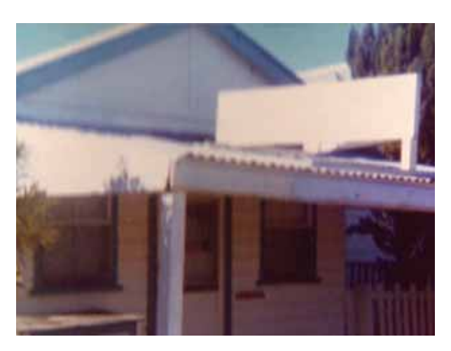
The Old Butchery.

A wharf was on the river opposite the site of Jamieson's Store. Before the rail transport reached