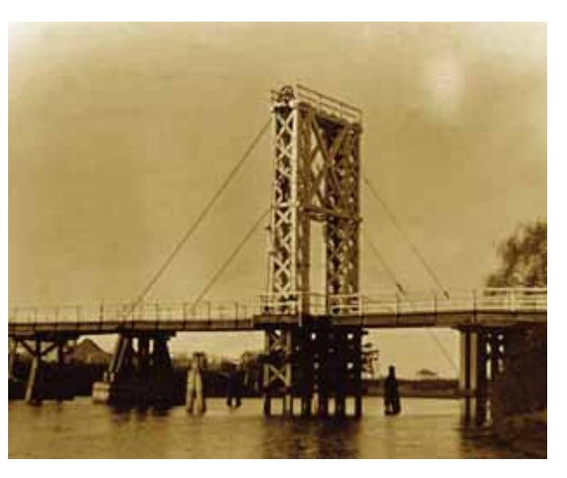
The original Kinchela Bridge.

In 1923 the tower collapsed as teredo (water cobra) had undermined the supports. In 1925 another