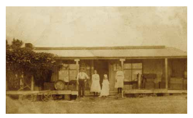
Balls General Store.

stating "it was the best church outside Kempsey, a handsome structure with cathedral windows and illuminated by acetylene gas". The Church was closed in 1986.