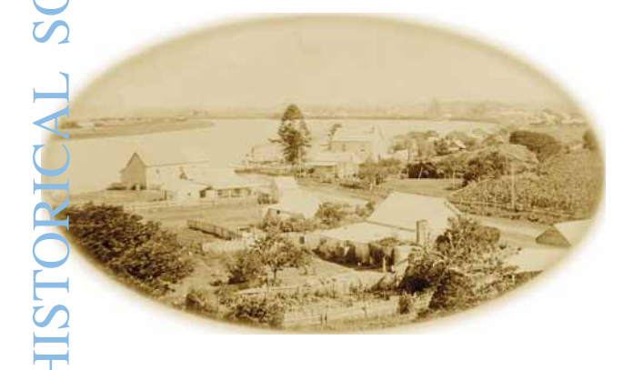
Walks in History